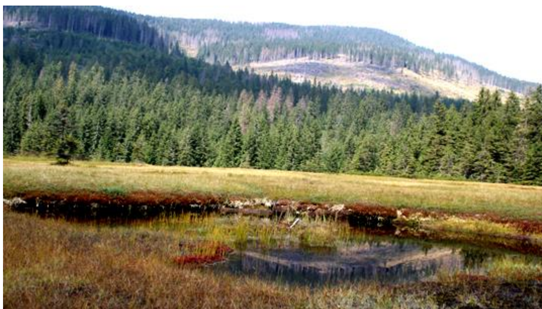
Fig.3. Izbuc-Calineasa-Ic area

consideration: The peatland region on the upper course of the Somesul Rece and the peatland region from the upper course of Somesul Cald, Muntele Mare and Dobrin.