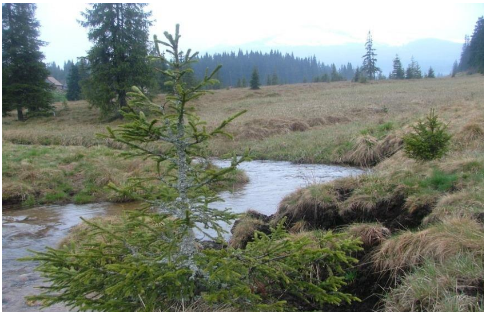
Fig.4. Somesului Cald area, Muntele Mare

The observations regarding the predominant vegetation of the peatlands chosen in the study, focused on the study of the plant association. The association is understood as „a combination of plants with a certain composition, presenting an uniform physiognomy and vegetating in uniform stationary conditions” [7].